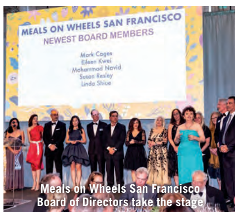
Meals on Wheels San Francisco Board of Directors take the stage